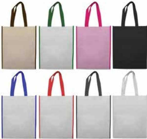
NW-V Vertical Non-Woven Bags Specifications : Size : 30 x 38 x 12 cm